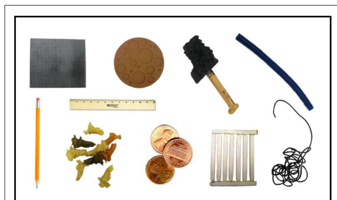
FIGURE 1 | Stimuli used during the experiment. There were four known objects (ruler, pennies, string, and pencil) and six novel objects. Please note that objects are not scaled according to size.

At the beginning of the experiment, children were told they were going to play a game in which they would learn to measure things. Adults were told that they were going to play a game that was