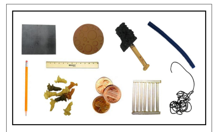
FIGURE 1 | Stimuli used during the experiment. There were four known objects (ruler, pennies, string, and pencil) and six novel objects. Please note that objects are not scaled according to size.

At the beginning of the experiment, children were told they were going to play a game in which they would learn to measure things. Adults were told that they were going to play a game that was